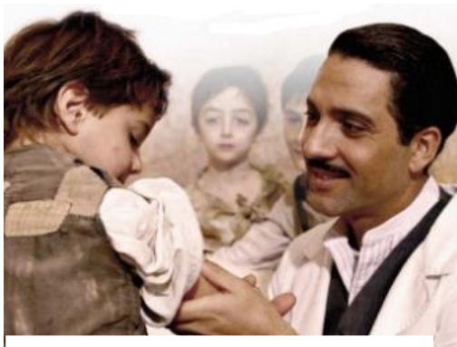
SAINT JOSEPH MOSCATI 1880 - 1927

they lived and worked and were transformed from within themselves, and through their inner conversion they transformed their societies and the people they lived among. They were so deeply convinced of God's call in their lives that nothing else mattered. James 1:22-25