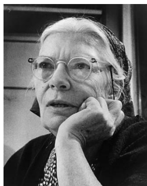
BL. DOROTHY DAY 1897 - 1980

“The greatest challenge of the day is: how to bring about a revolution of the heart, a revolution which has to start with each one of us?” Dorothy Day.